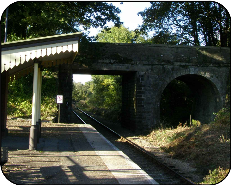
St Keyne Station